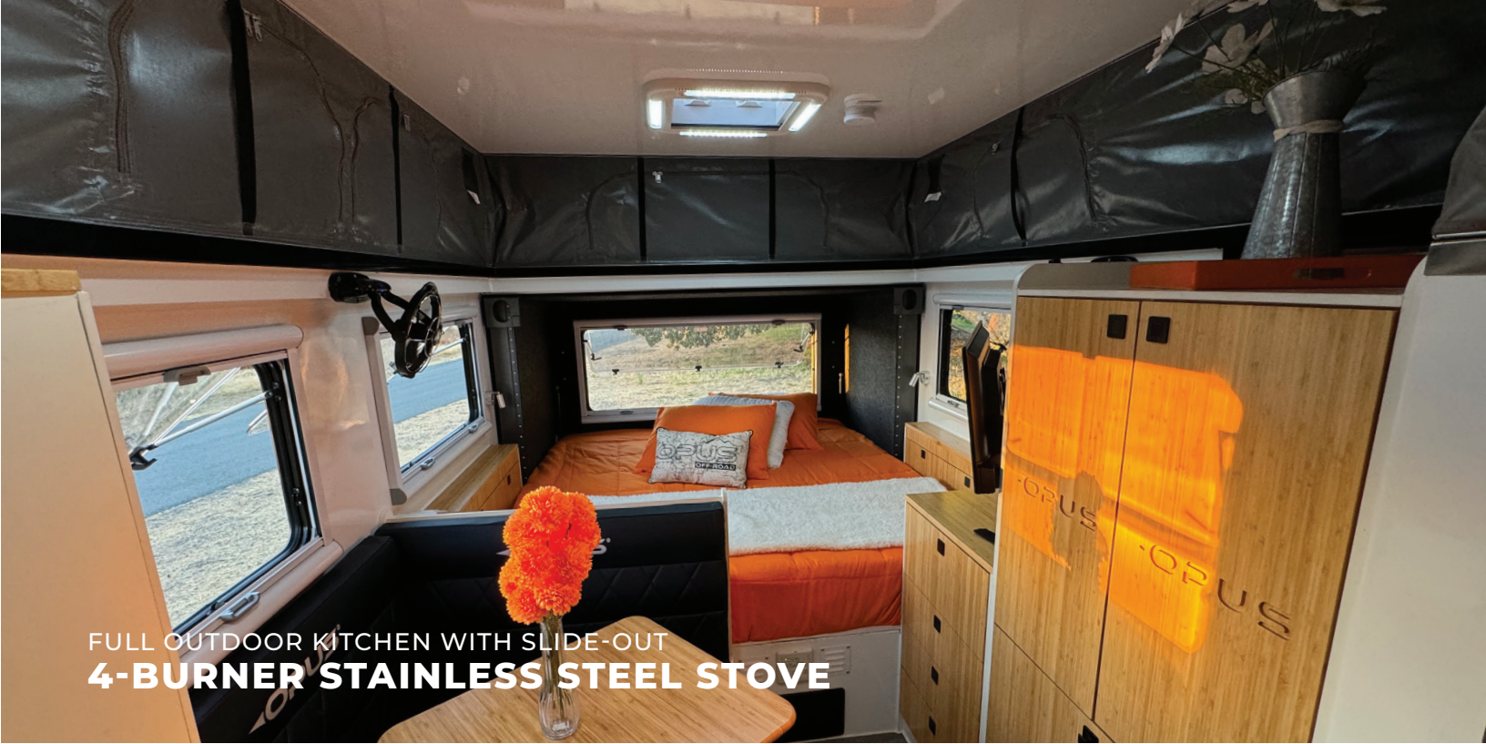
FULL OUTDOOR KITCHEN WITH SLIDE-OUT 4-BURNER STAINLESS STEEL STOVE