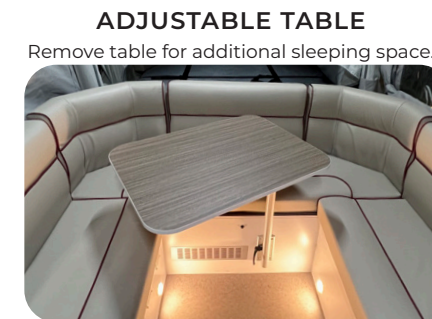
ADJUSTABLE TABLE Remove table for additional sleeping space.