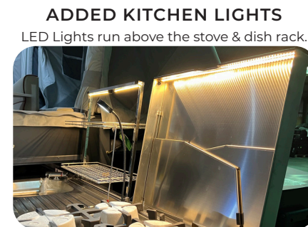
ADDED KITCHEN LIGHTS LED Lights run above the stove & dish rack.