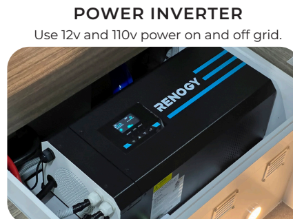
POWER INVERTER Use 12v and 110v power on and off grid.