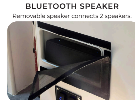
BLUETOOTH SPEAKER Removable speaker connects 2 speakers.