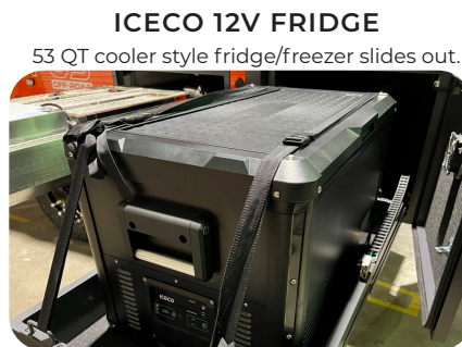
ICECO 12V FRIDGE 53 QT cooler style fridge/freezer slides out.